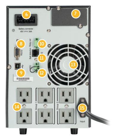
Model 9SX1500 shown here